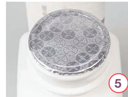
Safety features of Nexavar®-packaging (further variants might be available)