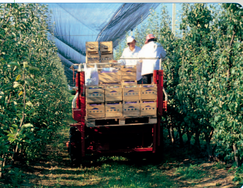
Waggon for the harvest – S. Musacci

To this end, the partners are working together to guarantee crop quality and ensure a limited presence of residues from the crop protection products.