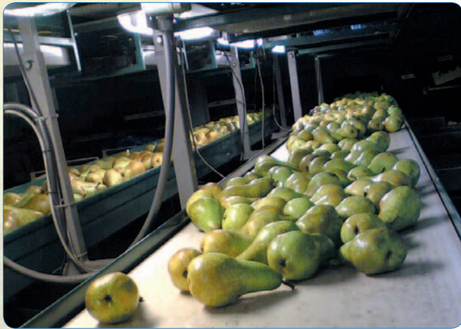
Selection and calibration phase – R. Vancini

The most important goal in pear protection – different ways of actions and a reduced use of phosphorganics – was tackled using innovative products from Bayer CropScience. Whereas in the past, different concepts were used to achieve the key objective of providing the end consumer with produce grown and marketed in a professional manner, today the links created between the various partners in the food chain guarantee safe, high quality and healthy fruit.