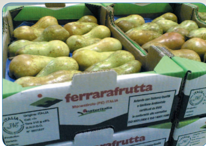
Pears Abate Fetel