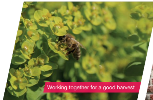
Working together for a good harvest

When crop protection products are applied using the Dropleg UL precision spraying system by Lechler, the treatment is applied below the flowering zone and thus prevents direct contact with bees and other pollinators.