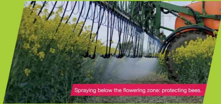
Spraying below the flowering zone: protecting bees.

When crop protection products are applied using the Dropleg UL precision spraying system by Lechler, the treatment is applied below the flowering zone and thus prevents direct contact with bees and other pollinators.