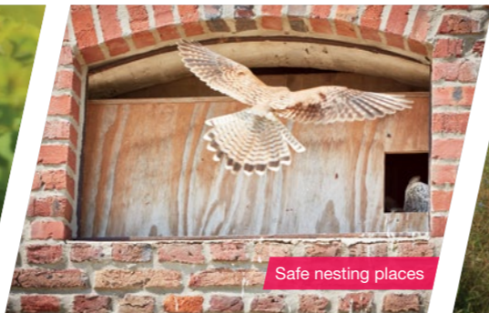
Safe nesting places