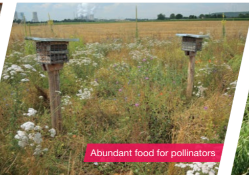
Abundant food for pollinators

“By putting in place many small measures, we preserve biodiversity at Damianshof in an effective and practical way.”