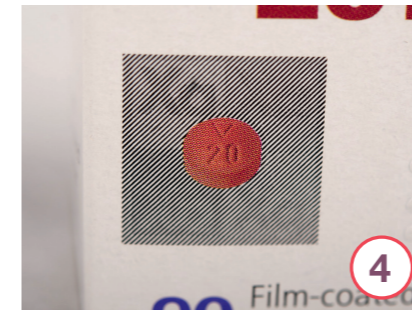
Safety features of Xarelto -packaging (further variants might be available)