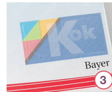
Safety features of Kovaltry®-packaging (further variants might be available)