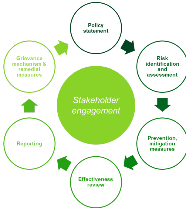
Human Rights Due Diligence in Accordance with the UNGPs at Bayer

In 2030, we want to be industry-leading in our approach to human rights. With this ambition in sight and acknowledging that human rights due diligence is a continuous process, we further developed our human rights strategy in 2021.